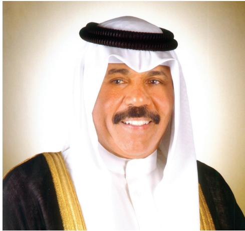
Nawaf Al -Ahmad Al-Jaber Al-Sabah Amir of Kuwait