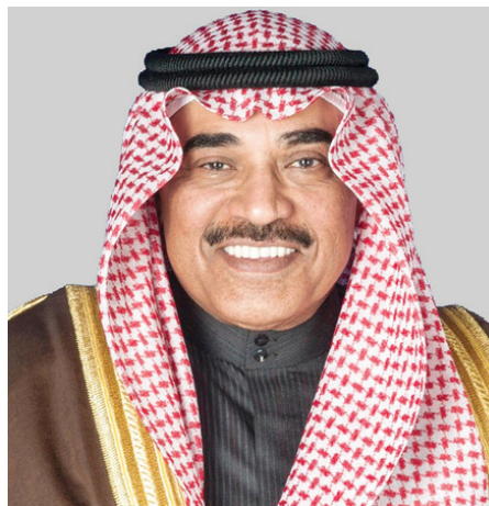
Sabah Al-Khalid Al-Sabah Prime Minister of Kuwait