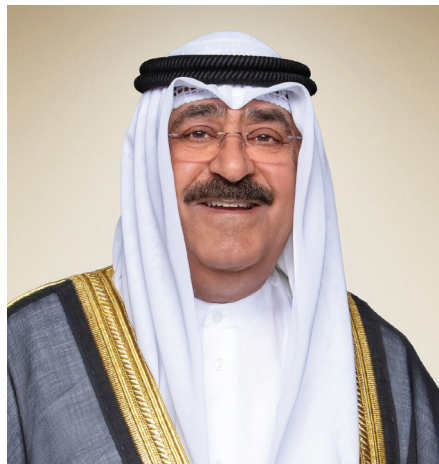
Mishal Al-Ahmad Al-jaber Al-Sabah Crown Princes of Kuwait